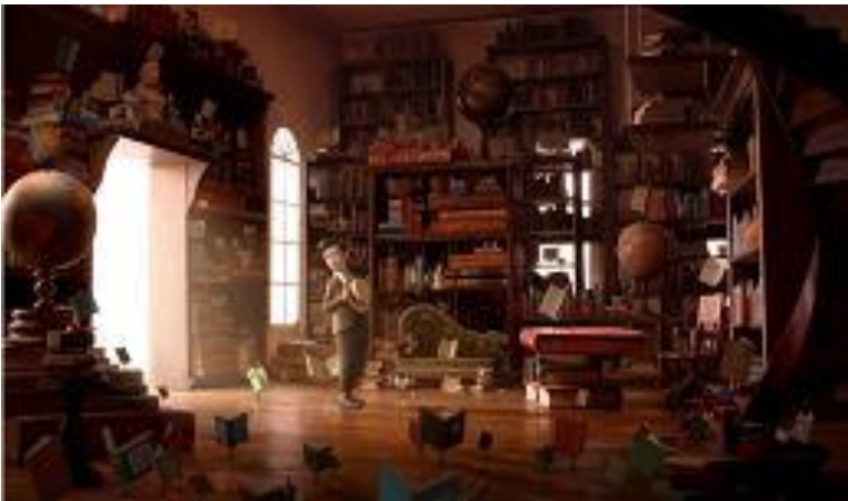
"The Fantastic Flying Books of Mr. Morris Lessmore" (US) 84 th Academy Awards Winner, Animated Short