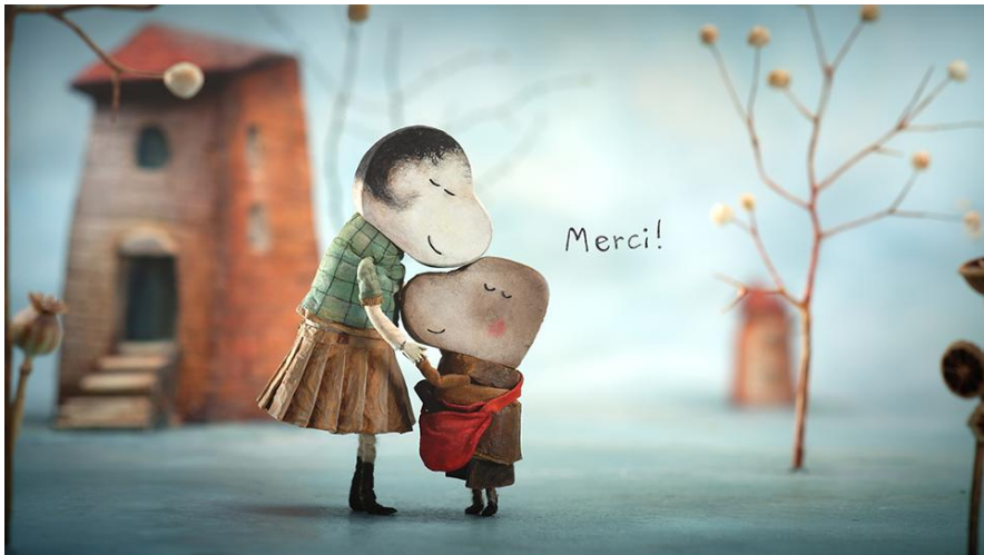
“Anatole’s Little Saucepan” (Belgium/France)