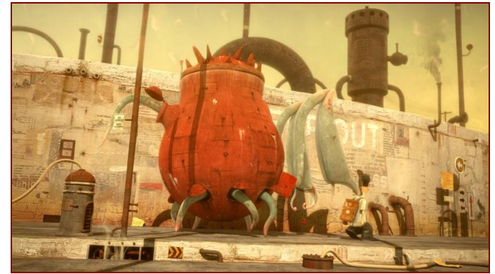
"The Lost Thing" (Australia) 83 rd Academy Awards Winner, Animated Short