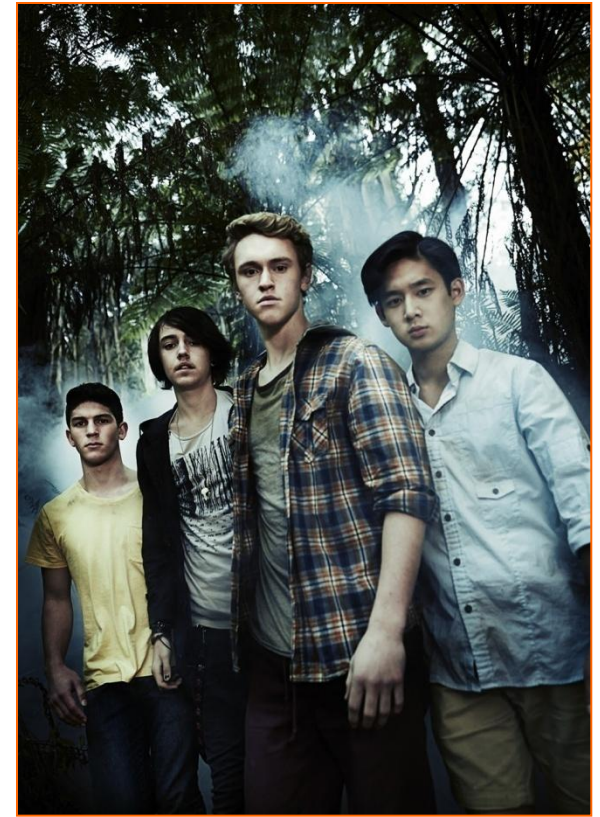
"Nowhere Boys" (Australia): Live -action Television