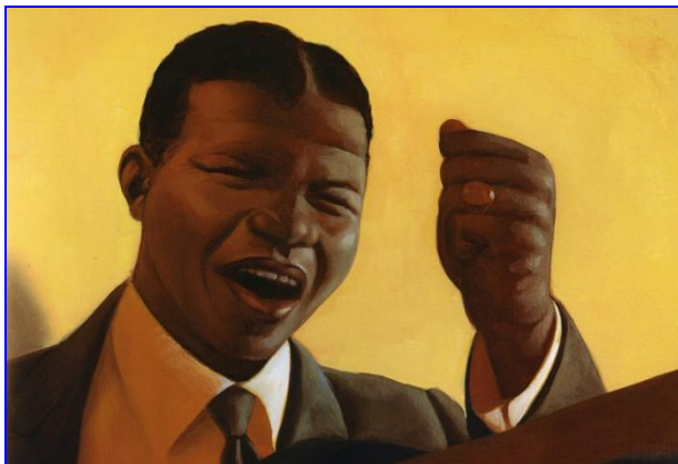
Stories of African and African American Lives 2014: “Nelson Mandela”, (USA) Animated short film

“No Bullies, Please” shorts programs get the conversation started about bullying or Pre-K & K through high school grades, featuring relatable situations and familiar stories that spark lively and constructive dialogue. Aligned with governmental social emotional learning goals and constructs, short films start conversations, led by trained media educators. Films include content related to various types of bullying situations and resolutions, including social media abuse, sexual orientation bias, interreligious conflict, racial/cultural issues, immigration relations, gender-based point of view, acceptances of people with disabilities or other challenges.