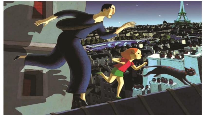
"A Cat in Paris" (France) 84 th Academy Awards Nominee