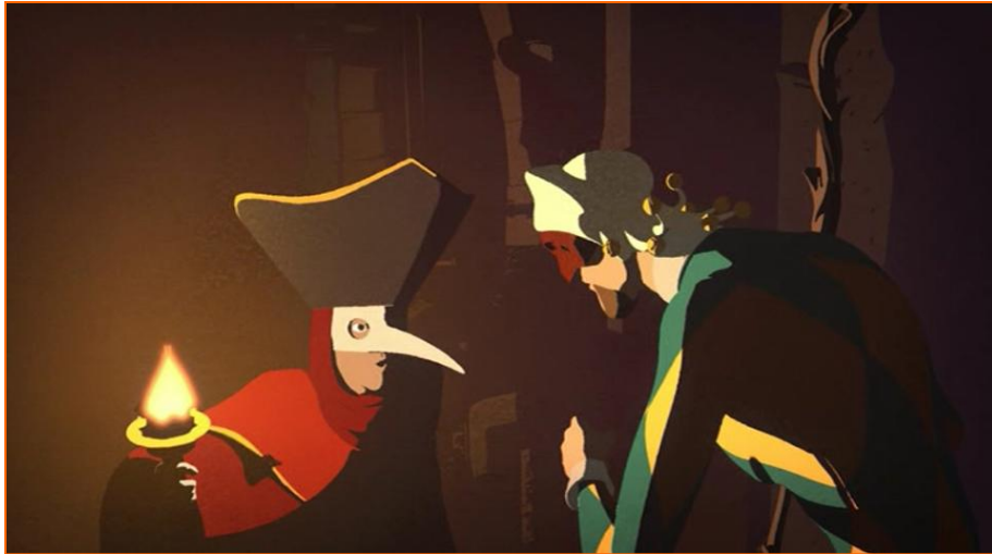
"Cask of Amontillado" (USA)