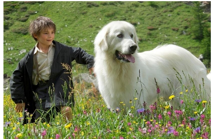
“Belle and Sebastian” (France)